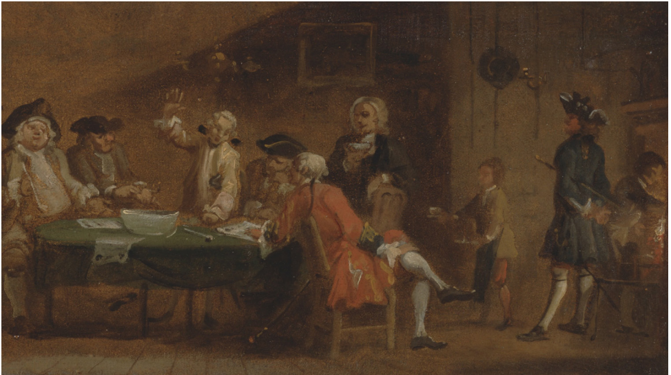
Joseph Highmore, detail from Figures in a Tavern or Coffee House Oil on Panel, c. 1725